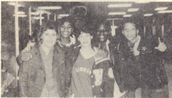
RAIDERS AT THE COKE CLASSIC